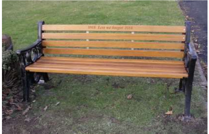
The new seat commissioned by the Parish Council

Because of the impending 100 th anniversary of the armistice Witton Gilbert Parish Council considered it appropriate to do something over and above the usual remembrance ceremony in November to commemorate those from Witton Gilbert and surrounding areas who gave their lives in this and other conflicts.