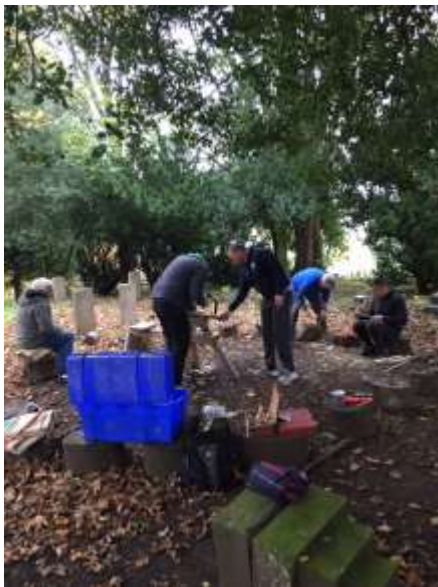
Ongoing work at Witton Dene