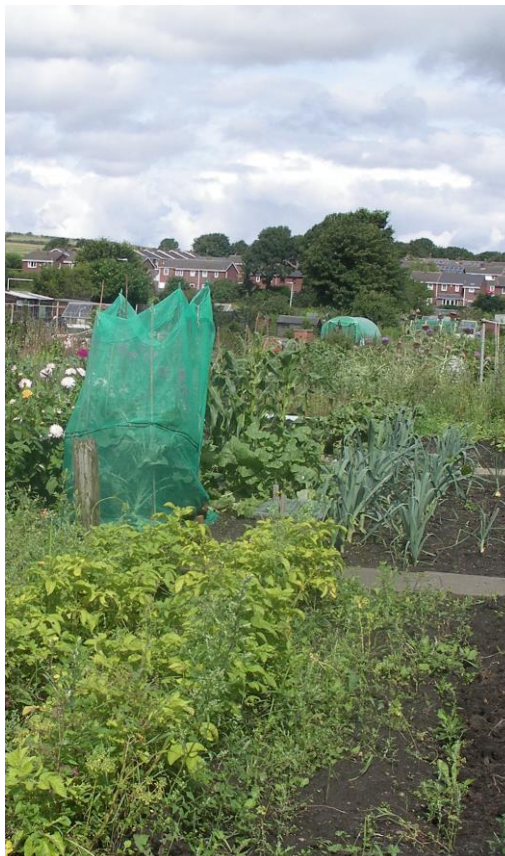
Sacriston Lane Allotments

The Parish Council intend to do everything within their power to preserve this valuable resource for future generations.