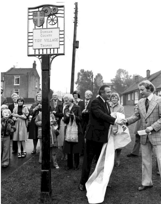
Presentation of the Durham County Tidy Village award in 1979

It was a great honour for the village and everyone was praised for their hard work, including the many volunteers and the school who had all played their part in making the village clean and attractive.